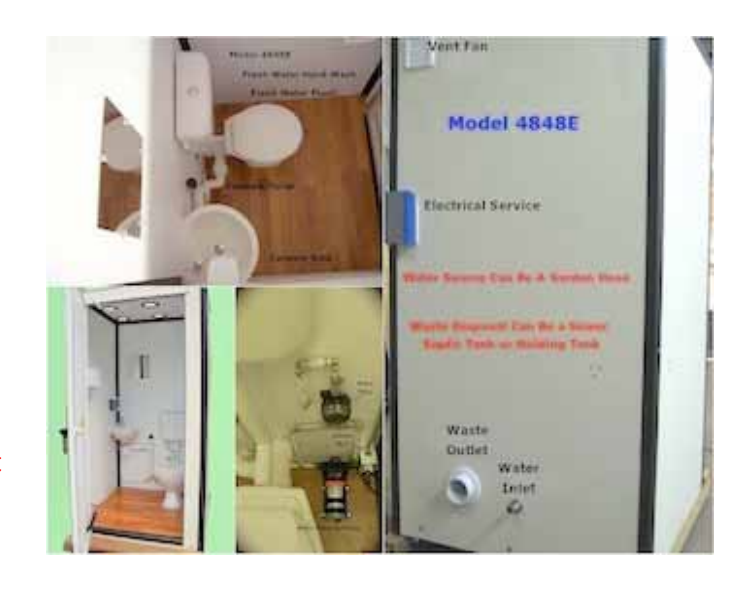
Model 4848E Fresh Water Hand Wash Station