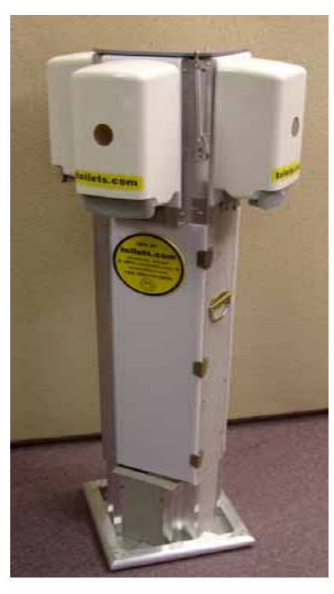
Portable – Can Be Anchored to Wall or Ground