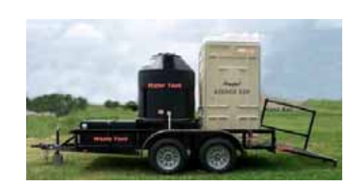
SJSDCS 600 Self Contained Mobile Comfort Station