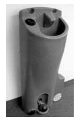
Foaming Hand Soap - 9" Toilet Roll – Hand Towel Dispensers are Included