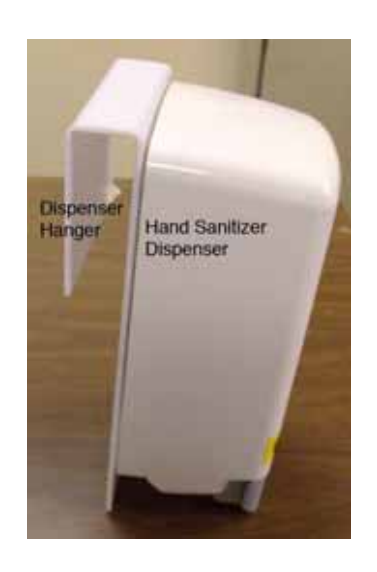
Dispenser with Attached Mounting Bracket