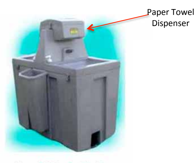
Hand Wash Station