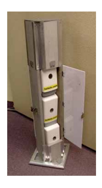
On Site Storage for Four Dispensers