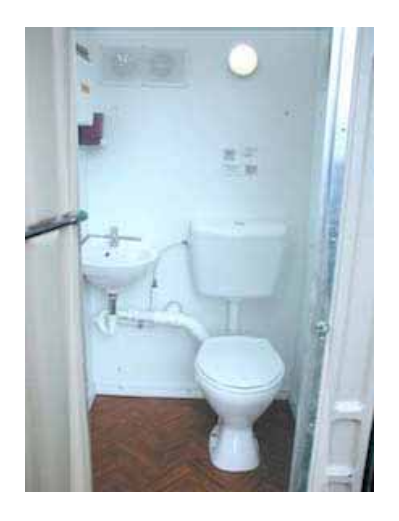
Model SJSPCS 600 Ceramic Bowl & Sink